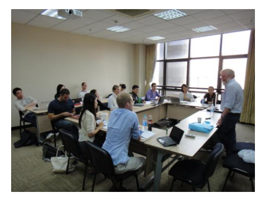
Fudan University School of Law

Email any questions to: <u>FudanLLM@fudan.edu.cn</u>, or call: (86) 21-5163-0063