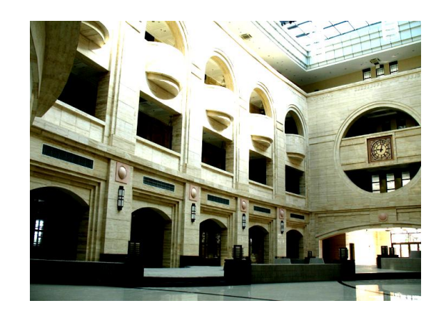
Fudan University School of Law